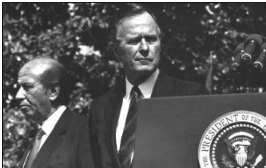
George Bush's favourite Ibero-American leader, Venezuelan President Carlos Andrés Pérez, meets with Bush in Washington.

...only one figure emerged unscathed: George Bush, who alone retained control of US$3.8 billion in laundered funds.